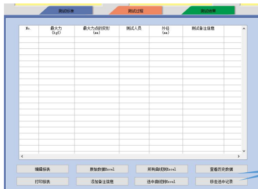
Word、excel、PDF ,Multiple formats arbitrary output and