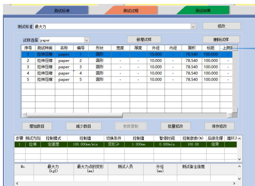
The various test methods are one-click option without professional editing. Humanization, avoid computer software design, make the customer experience free.